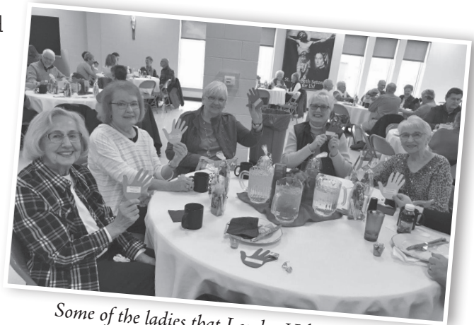
Some of the ladies that Lend a Helping Hand!